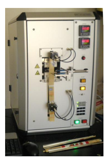
Fig.1.The Hot tack instrument model 52-F/300

Semi-stiff materials like coated card board can also be tested. Test sample preparation and handling is described in the manuals.