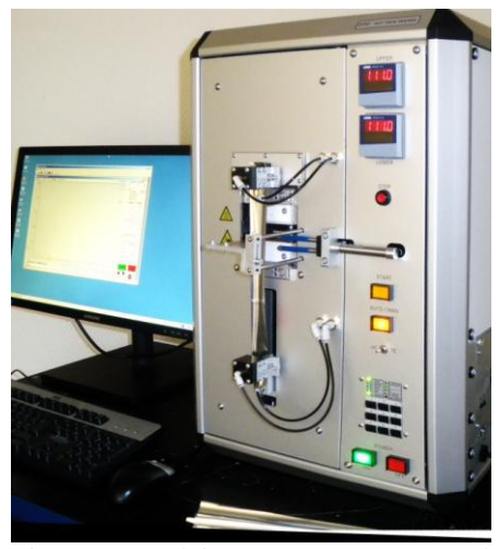
Fig.2. Hot tack instrument 52-F/300 and PC

A detailed description of the test software Wintack is available. This document shows some Examples of Test Results / Summary Reports/ on page 4.